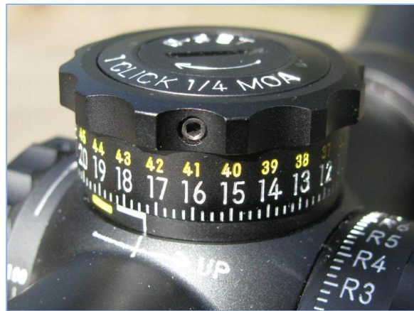
Figure 2. US Optics Telescopic Sight

A quick and easy way to tell if a scope is ¼ MOA is to look at the numbers and hash marks on the external turret (if it has one). There should be 3 dashes between each number.