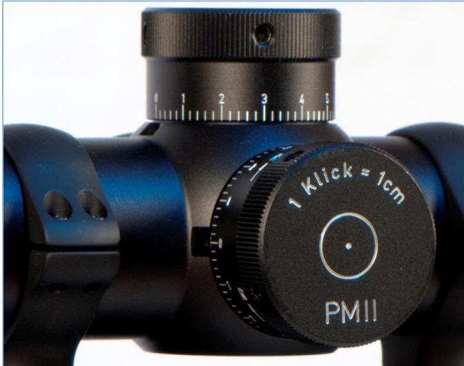
Figure 4. Schmidt & Bender PMII Telescopic Sight

A scope that has 1/10 th Milliradian clicks moves the bullet impact 1cm at 100m. A Milliradian turret will have 4 or 8 hash marks between each number, depending on the model.